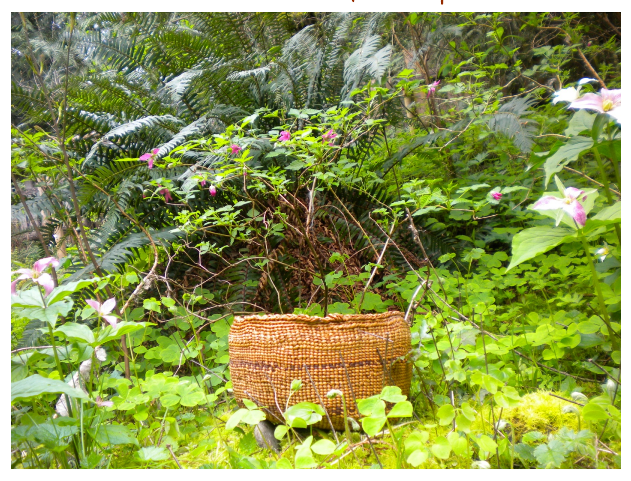
And Filling with Tools of Help-

Families, Providers & Community Together