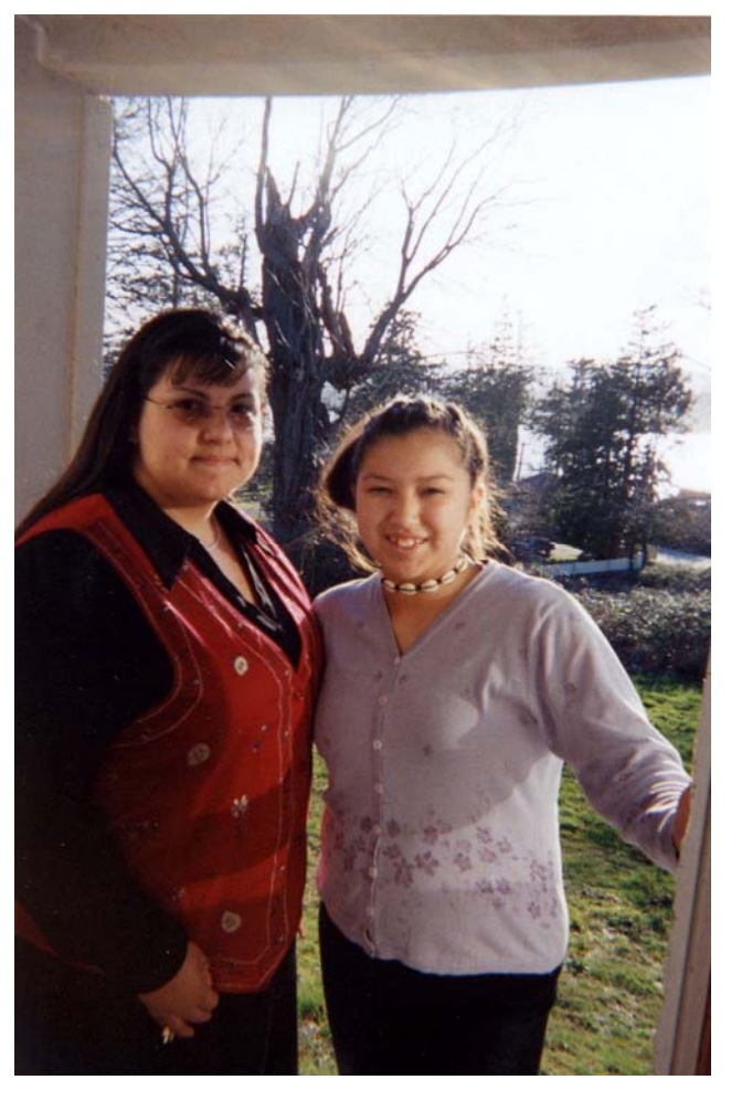
- A Story-

His body seems so much quieter now, sometimes almost too quiet, but then exploding in a fury of activity only to fall quiet again. He can't seem to get enough sleep though. Maybe if he didn't spend so much time sleep-walking and talking at night he'd feel more rested. He has some friends, but the connections don't really seem to run deep, and often he doesn't get invited to parties with these friends. I'm worried about his school work, but really, the most disturbing thing is his change in social ability. He forms friendships but can't seem to keep or sustain them. The only consistent person he keeps in his life is our spiritual leader with whom he does ceremony. In fact, ceremony seems to be the only time our son looks truly happy and at peace with himself. I think if he could just sweat everyday he'd probably never come out of the lodge. His room is a mess, a stinky mess, except for the things he uses in ceremony; those he keeps in a special spot in a special way. At Sundance, he seems so strong, lost in his total connection with Creator. I am so