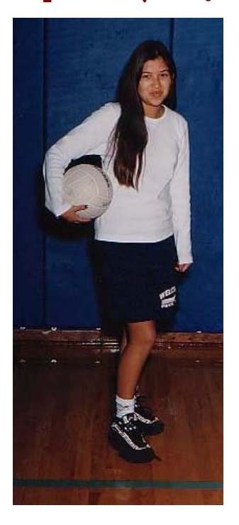
- A Story -

She is nine years old now. Her grandmothers and aunties, uncles and cousins, her sisters, and now teachers and friends continue to shape and support, honor and respect that spirit that is my daughter: the wonderful singer, excellent observer, spiritually inspired, beautiful girl.