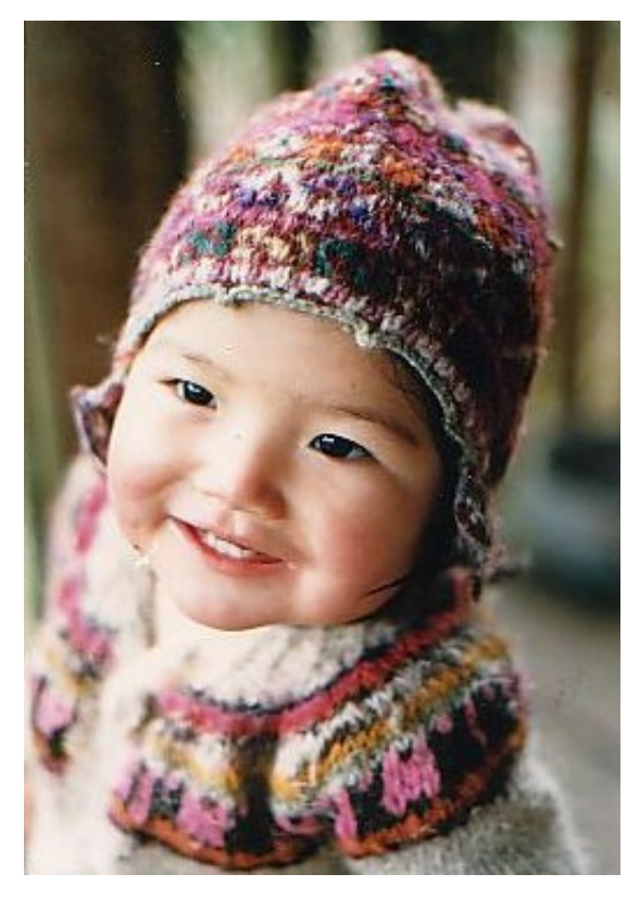
- A Story -

She is so active now. So cute, so friendly to everyone. Darting, climbing, falling, rolling everywhere. Nonstop motion, nonstop babble and chatter punctuated by screams of joy when she gets her way and screams of frustration when she doesn't or can't do something. So much a toddler, but still so clumsy and so "out there" that she can't seem to grasp the simplest of directions. You say, "Go get your shoes" and she goes but seldom comes back. You say "shoes" and she might run over to them but then just stare blankly at them not knowing what to do. Everything has to be said over and over and over until you want to scream with frustration. Nothing seems ever to be remembered and certainly is seldom, if ever, applied to the next situation which is just like the one before. Take safety for an example. So many times told not to go in the road. Told why not to go in the road. Told to look at the cars going by in the road. "They might hit you," you tell her. She just laughs and claps her hands in that flapping motion.