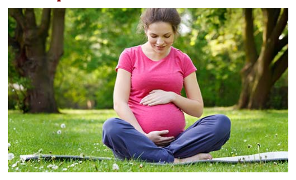
- A Story -