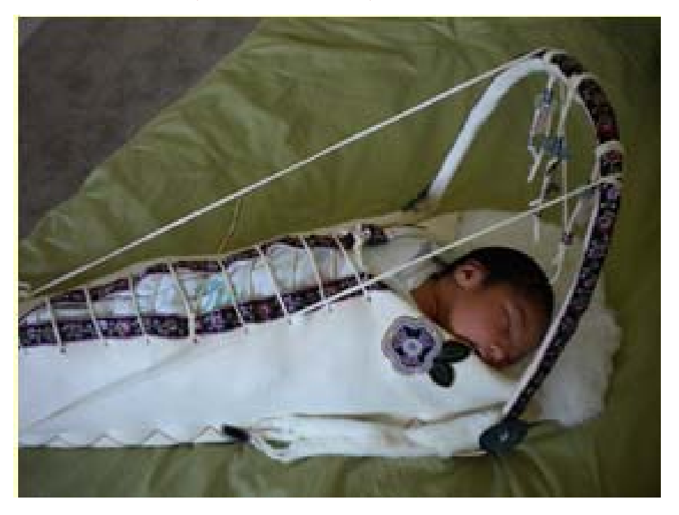
- A Story -